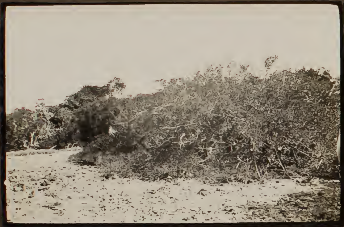
Inside lagoon swamp